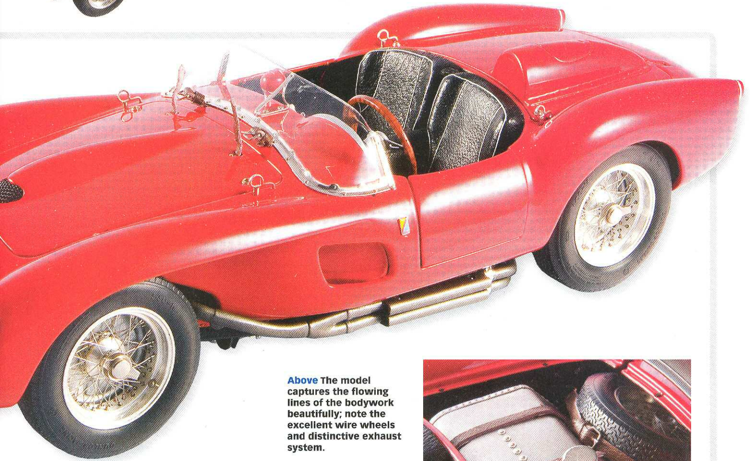
Above The model captures the flowing lines of the bodywork beautifully; note the excellent wire wheels and distinctive exhaust system.