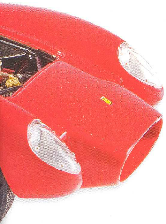
Below Interior detail is again second to none.