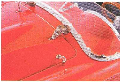
CMC includes details like the leather bonnet straps.