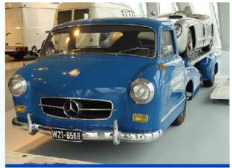
1:1 SCALE VEHICLE ON DISPLAY AT THE MERCEDES-BENZ MUSEUM, STUTTGART, GERMANY

the public could enjoy its beauty once again.