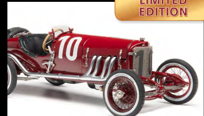
Item No. M-203