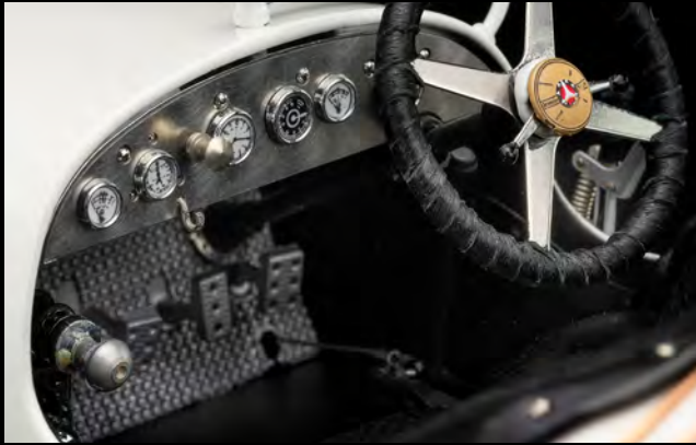
Authentically reproduced and highly detailed dashboard and leather-covered steering-wheel.