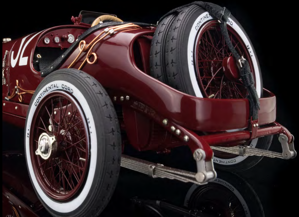
Following the latest research results, the vehicles carried two external spare wheels at their time.

CMC GmbH & Co. KG (Germany) Classic Model Cars Stuttgarter Str. 106 · D 70736 Fellbach Phone: +49-711-4 40 07 99-0 Email: info@cmc-modelcars.de www.cmc-modelcars.de