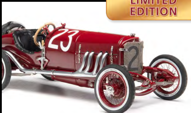
Item No. M-186

CMC Mercedes Two-litre Supercharged racer Targa Florio, Alfred Neubauer #23, 1924 Limited Edition 600 pcs.