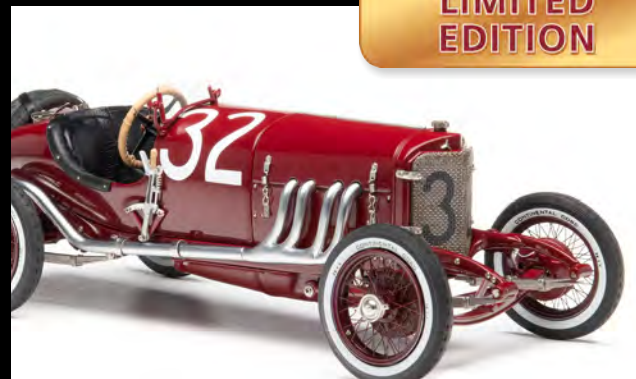
Item No. M-187

CMC Mercedes Two-litre Supercharged racer Targa Florio, Christian Lautenschlager #32, 1924 Limited Edition 600 pcs.