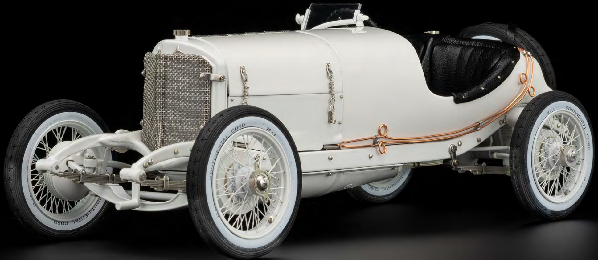
Art.-Nr. M-206 CMC Mercedes-Benz Targa Florio, 1924 – white