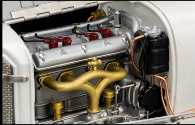
True-to-original inline four-cylinder engine with complete peripheral equipment and lines.