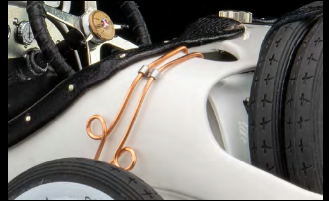
External gasoline pipes.